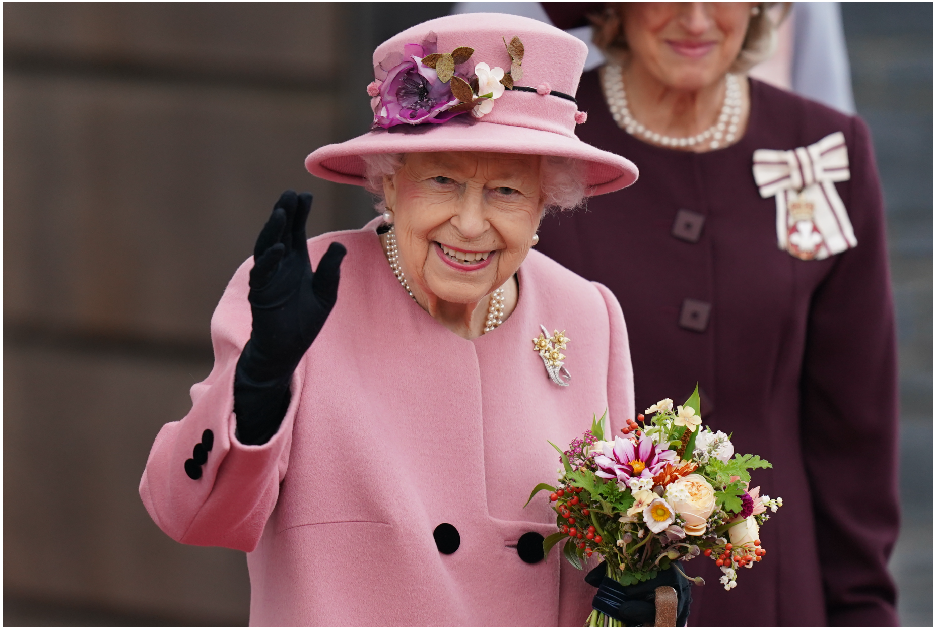
WILLENHALL FREE CHURCH SERVICE TO CELEBRATE THE QUEEN'S JUBILEE SUNDAY 29 MAY 2022